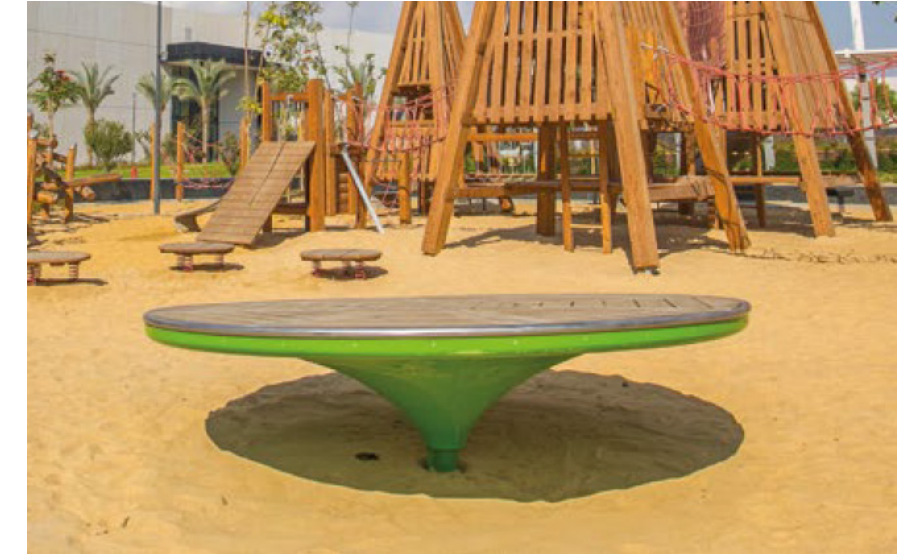
05 Wheelchair accessible in-ground roundabout