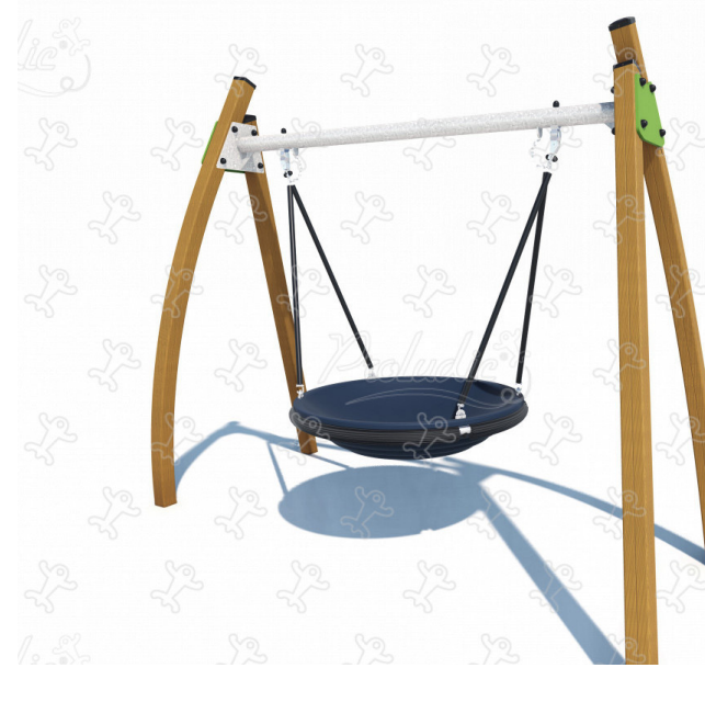
16 Swing – Inclusive boat swing & cradle swing