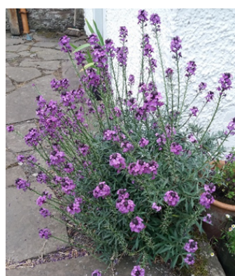
Erisimum Bowl's Mauve (Wall Flower)