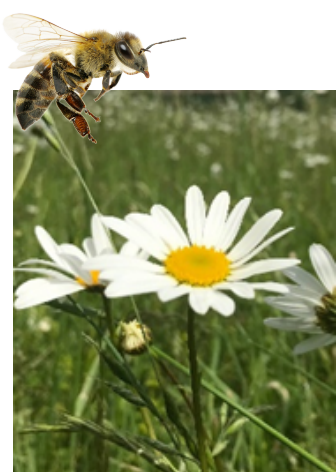
Ox eye Daisy